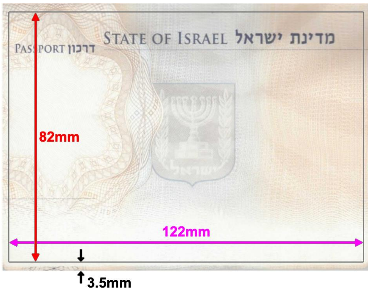
Figure 3 – Lamination area