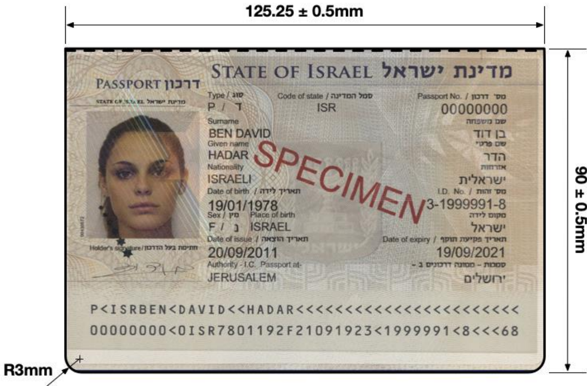
Figure 1– Booklet dimensions

The booklet dimensions conform to the ICAO specifications in DOC9303 part 4, section 2.3, except the narrow edge, which is 90mm and not 88mm.